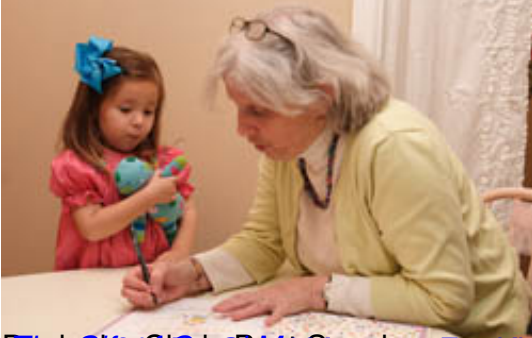
Book Offer: Cindy Post Senning: For Kids Book Offer: Cindy Post Senning: For Kids